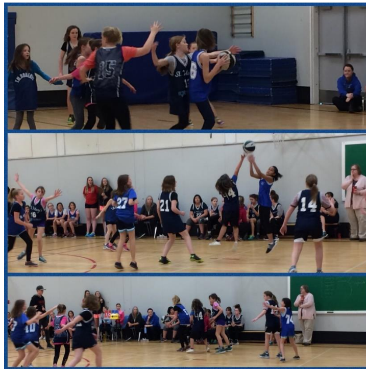
Our gr. 5/6 Girls' Basketball, playing St. Mary's